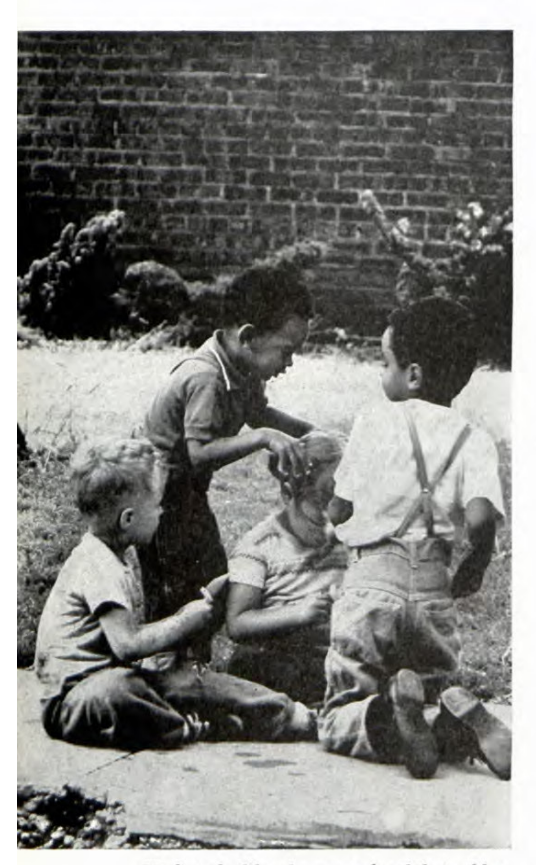
Undisturbed by the quarrels of their elders, children play in an integrated block where a Negro's house mysteriously caught fire.

"If anybody who is well established in this business in Chicago doesn't earn $100,000 a year, he is loafing."