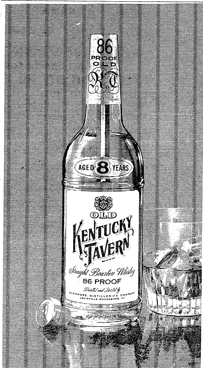
Nothing matches this rich, luxurious taste

ENGLEWOOD, N. J. — (UPI) — Parents protesting racial imbalance in the city school system began a sit in at the offices of the groups have joined in the sponsorship of the meeting. Thirty - seven community groups have joined in the sponsorship of the meeting.