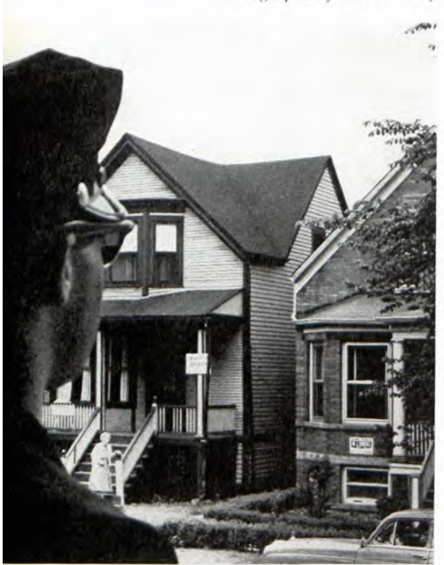
A policeman guards a Negro-owned house that "busted" a May Street block. Along the street, FOR SALE signs are already up.

New York City, Boston, Cleveland, Detroit, St. Louis and other cities and in some of their suburbs. Chicago alone has more than 100 of us. Because few Negroes can command the necessary financing to enter this occupation, most of us are white, as I am. Over the past ten years we have helped "change" an average of two to three blocks a week in Chicago. Even now, with the overall housing market rather quiet, we bust a new block in Chicago every four to eight days