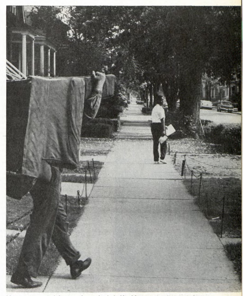
Movers carry out the belongings of a couple who had lived for twenty-two years in southwest Chicago. They left when the first Negroes to come into the block bought the house next door.